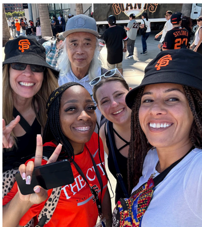
DISH Residents and team rooting for the Giants!

to build confidence to re-engage. During 2023, DISH hosted a wide variety of classes by partnering with local organizations including cooking, digital literacy, gentle movement, guitar, poetry, and more!