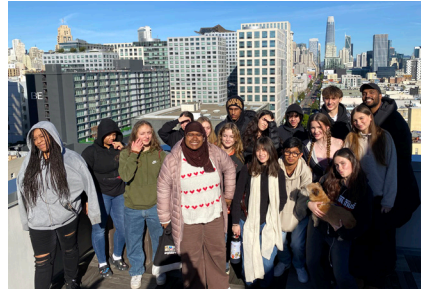
Gateway High School Volunteers