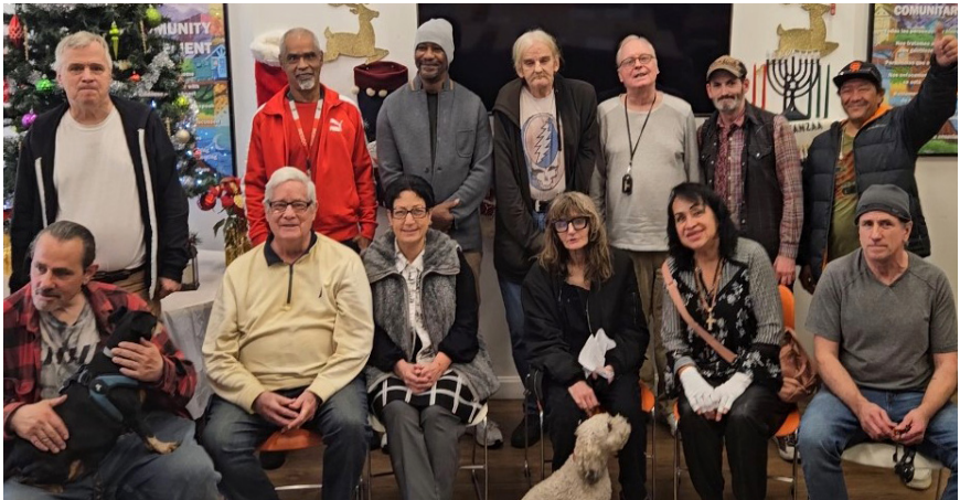
Community Advisory Board Members

California's investment in supportive housing is building new homes and opportunities for many across the state. The expansion has highlighted the strains on the capacity of the supportive housing provider community, particularly for mission-driven property management. Through our consulting services, we get to talk about what we love to do with new providers helping them remove barriers, support housing retention, and invest in resident and staff wellness.